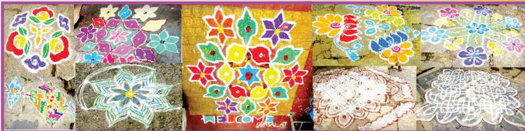
Colourful Rangolis made by Community members